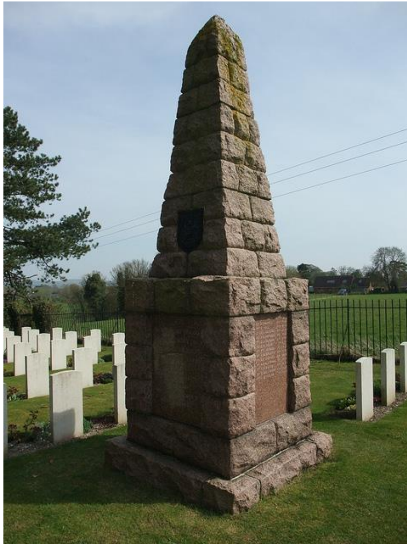
Memorial to 1 st Training Battalion A.I.F. at Durrington Cemetery